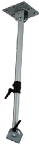
EM880M —Medium ceiling mount extension pole (500mm—750mm)