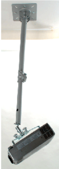
EM880L —Long ceiling mount extension pole (750mm—1222mm)