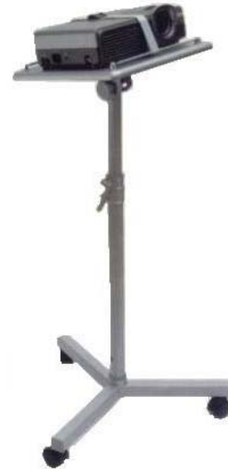
EM890: Portable LCD Projector trolley. Adjusts from 785mm - 1265mm in height. Maximum weight capacity 25 kg's. Lockable castor base. Projector tray tilts up to 20 degrees. Finished in silver. Supplied with securing strap for projector.